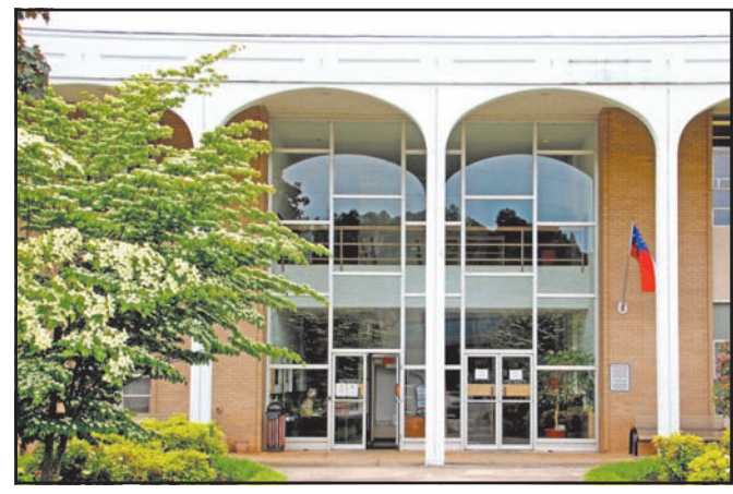
The Towns County Courthouse

Currently, the commissioner's office is sorting out what to do with the