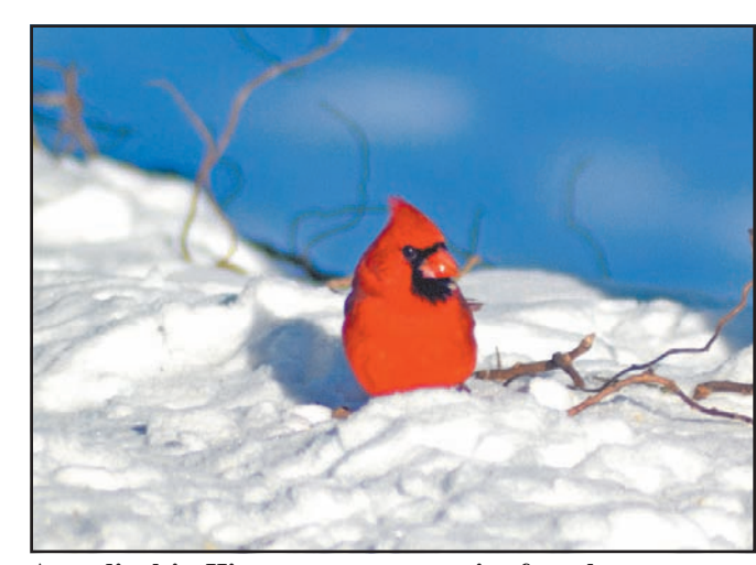
A cardinal in Hiawassee snow – as is often the case, snow bookended 2017, with Winter Storm Helena hitting in January and Winter Storm Benji coming in December.

GDOT announced its See 2017 Review, Page 8A